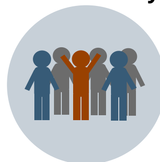
Avoid exposure at large gatherings