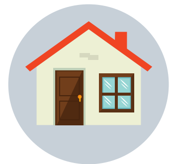
Stay at home if you're sick