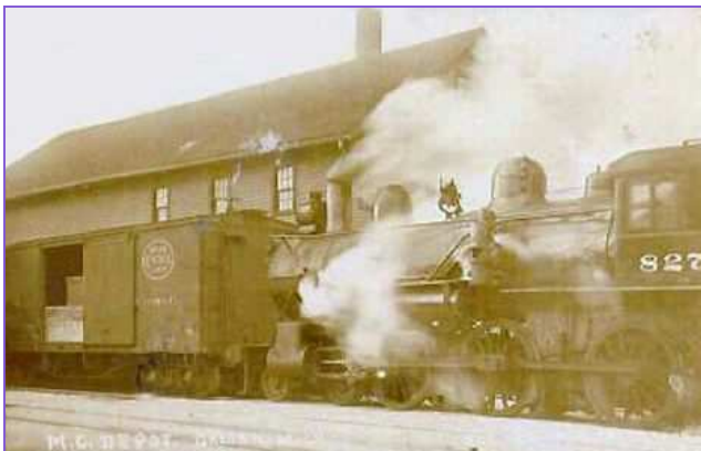
Michigan Central Railroad Depot in Galien