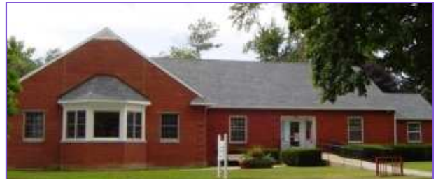
Galien Public Library