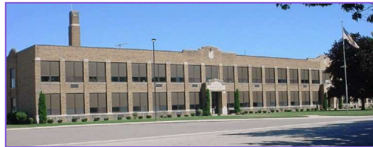
Galien High School

Galien Township Schools 122 E. Southeastern Avenue Galien MI 49113 Phone: (269) 545-3364