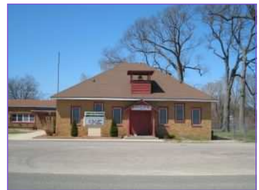
Riverside School Hagar Township #6