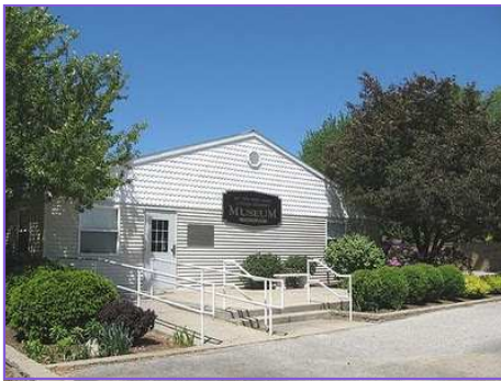
Southwestern Michigan Crate, Barrel & Veneer Machinery Museum