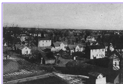
Historical Photo of Shingle Diggins