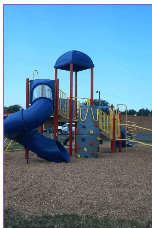
South Elementary School